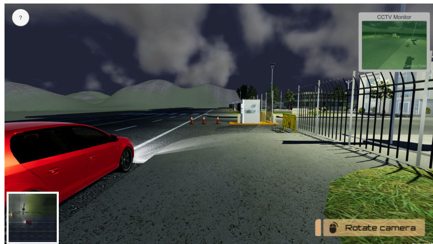
Cyber Security NOC Night Game Main Menu