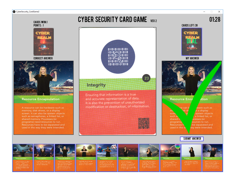
Step 7: Repeat Step1 through Step 6 to find answers for all Question cards.