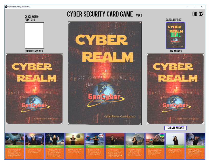
Step 1: Click the deal card to reveal Question card