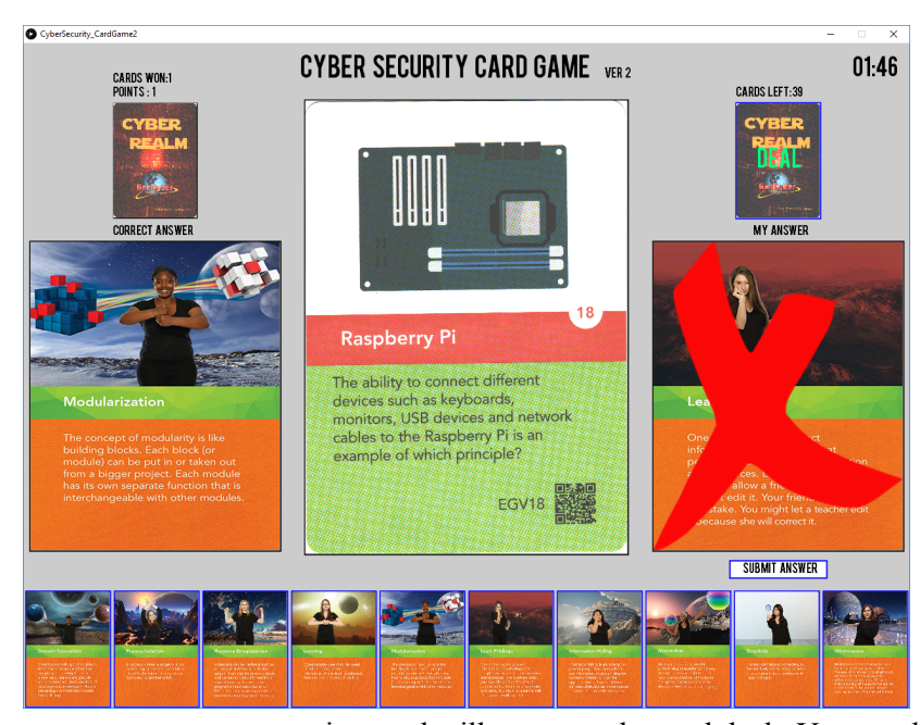
Step 6: If you answer wrong, your question card will return to the card deck. You need to click "deal" button to choose new question card. If you answer correct, you will see the following screen.